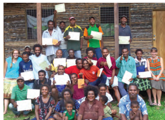
Teaching a Bible course in Papua New Guinea

“Diversity: I enjoy doing a variety of things — my job allows me to have time in villages, time behind a computer, travel, share with others, be involved with many different projects — I love the diversity of what I get to do and the diversity of the many people I work with!