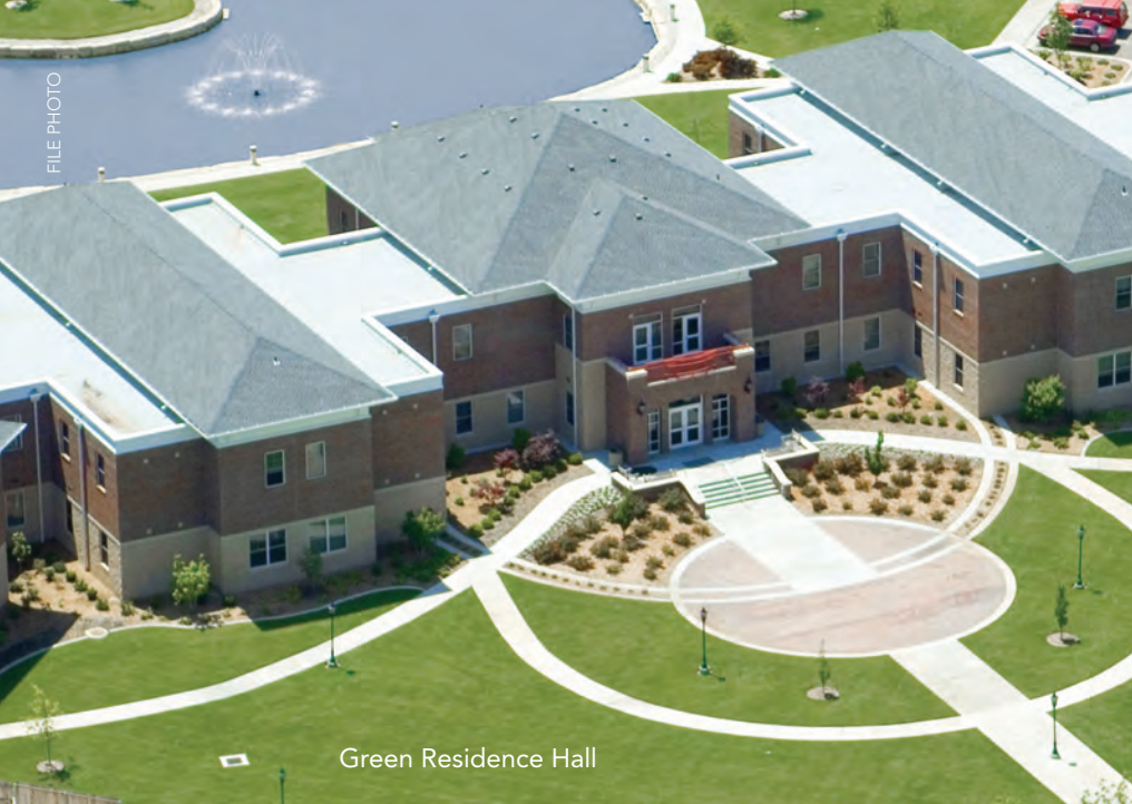
Green Residence Hall