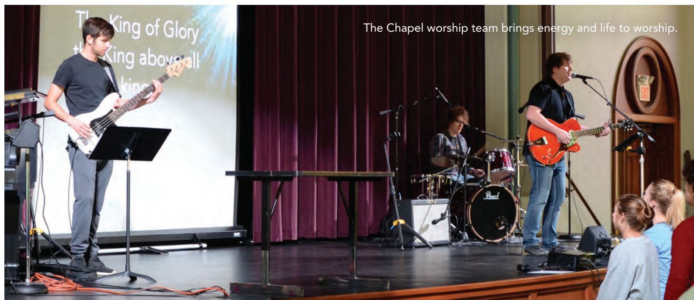
The Chapel worship team brings energy and life to worship.